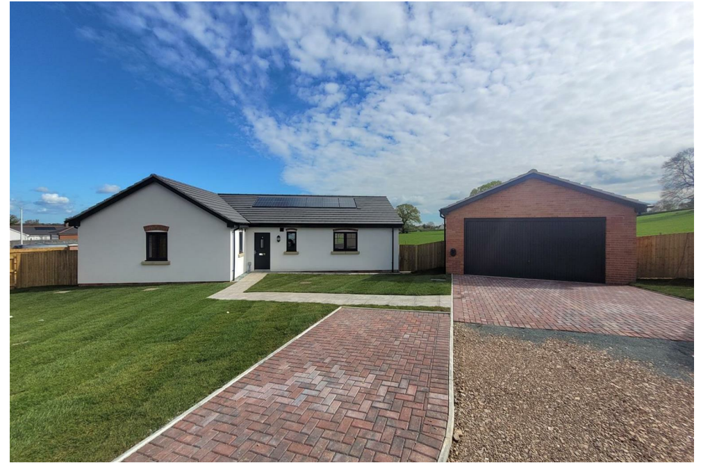
Plot 13, Somerford Reach Cae Heulog,, Arddleen, Llanymynech, SY22 6FJ £380,000

NEW DEVELOPMENT - One of the largest bungalows available from Primesave. With its spacious design and ample-sized driveway, the Rowan is the perfect property to relax and enjoy your surroundings. As soon as you walk through the front door and into the entrance hall, you'll find yourself with a fantastic space in which to enjoy your new life.